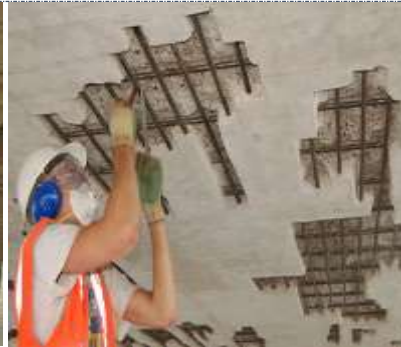
Repair & Rehabilitation