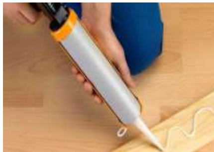
Adhesive & sealants