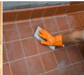
Epoxy Tile Grouts